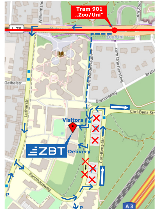
Data from OpenStreetMap – published under ODbL

Take the SkyTrain from the terminal to Düsseldorf Airport station. From there, take a train to Duisburg main station, then continue as described above.